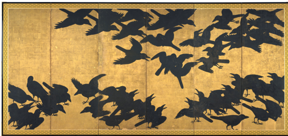
Crows, early 17th century, Japanese, pair of six-panel screens; ink and gold on paper, 61 9/16 x 139 5/16 in., Seattle Art Museum, Eugene Fuller Memorial Collection, 36.21.2.

Pulitzer Arts Foundation 3716 Washington Boulevard St. Louis, MO 63108