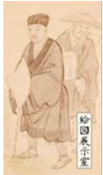
Matsuo Basho (1644-1694).