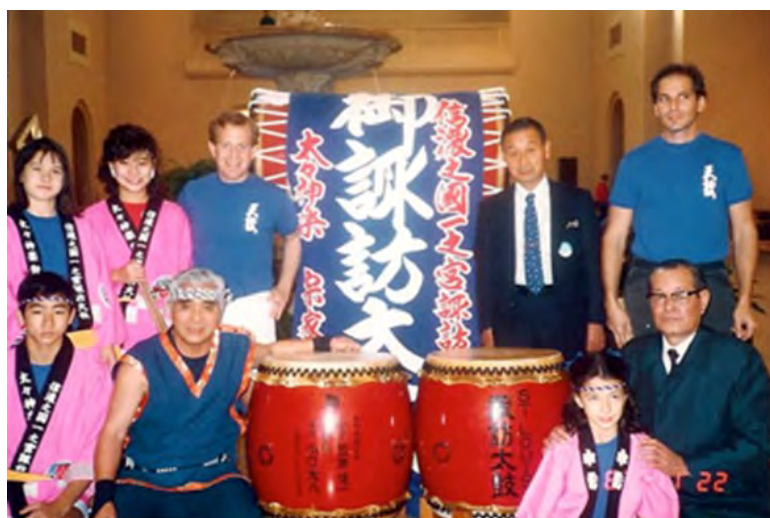
The original St. Louis Osuwa Taiko in 1987 started out as a children’s group.