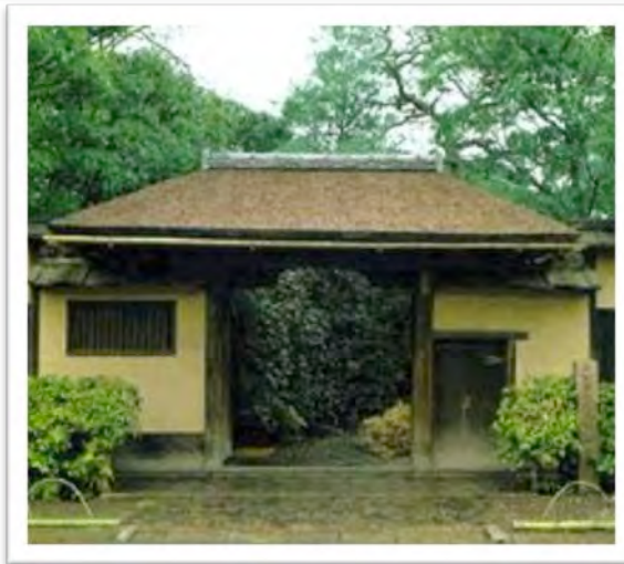
裏千家宗家今日庵 Urasenke Souke Kon-nichi-an

Seats are limited to 6 and sold on a first come, first serve basis